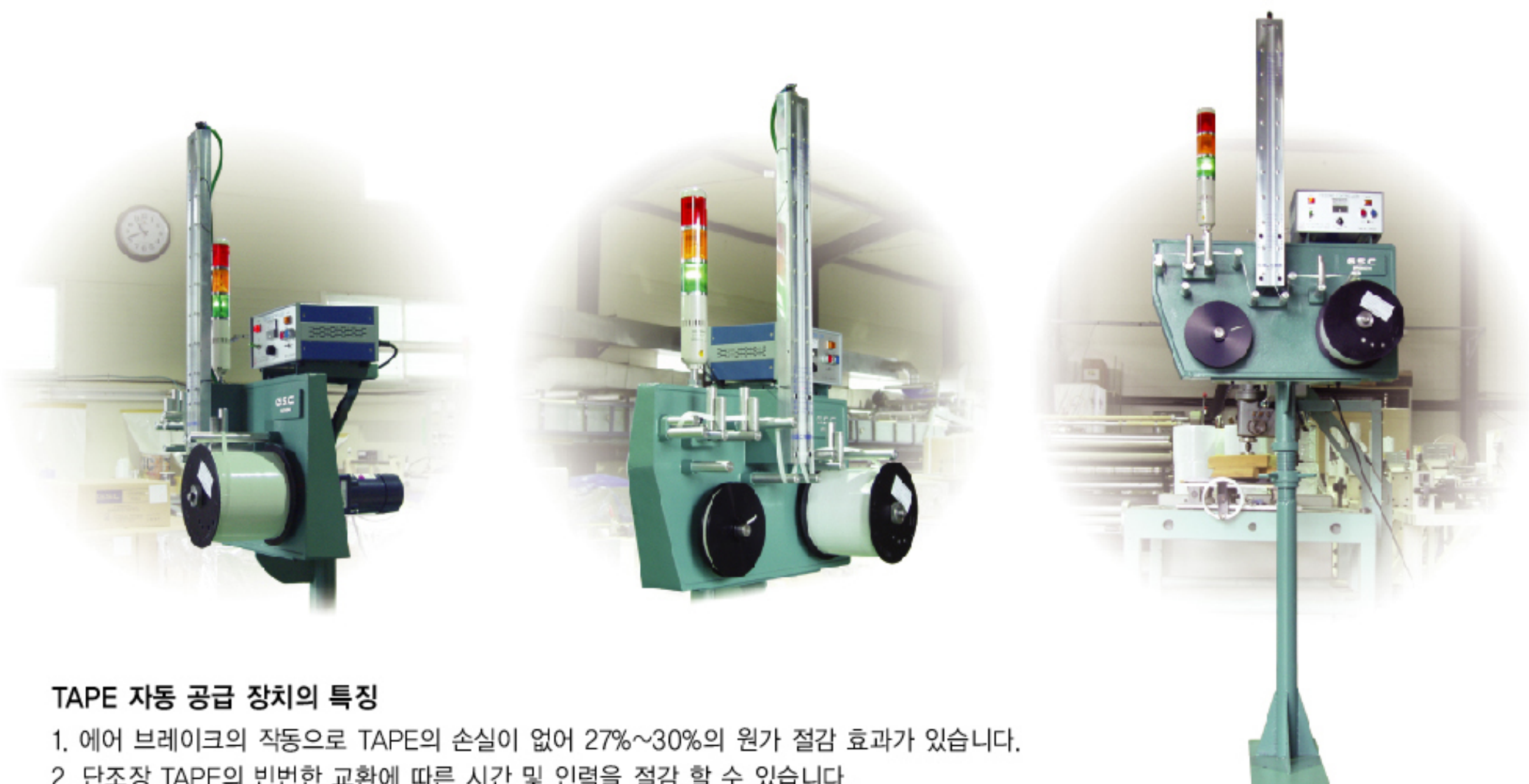
G.S.C Automatic Feeding Instrument for Long Length Marking Tape.